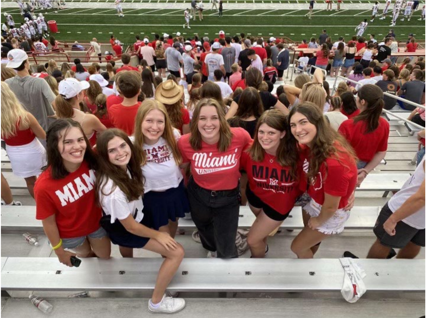
Gilroy-Morgan Hill Assembly